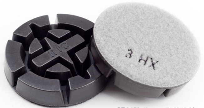
DT 3 HX - Item no: 213340-3A

The new DT 3 & 5 tools have unsurpassed scratch removal ability which enables the operator to move safely between metal and resin tooling, but also make it possible to skip grinding steps. To ensure a perfect end result, the DT tools are optimized for hard and extra hard concrete, where it is essential for the contractor to remove scratches from the initial metal bond grinding steps.