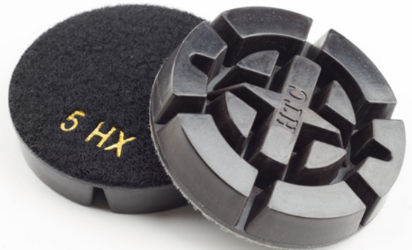
DT 5 HX - Item no: 213340-5A