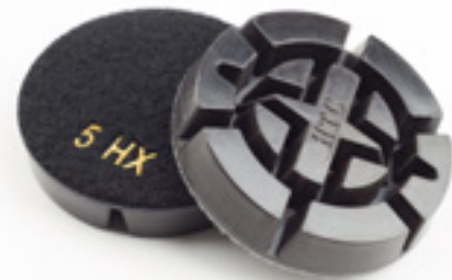
DT 5 HX - Item no: 593330502