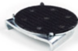
EZ Wing Metal 3" Puck Holder - Item no: 596944501