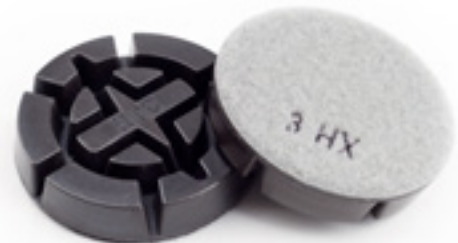
DT 3 HX - Item no: 593330403

The new DT 3 & 5 tools have unsurpassed scratch removal ability which enables the operator to move safely between metal and resin tooling, but also make it possible to skip grinding steps. To ensure a perfect end result, the DT tools are optimized for hard and extra hard concrete, where it is essential for the contractor to remove scratches from the initial metal bond grinding steps.