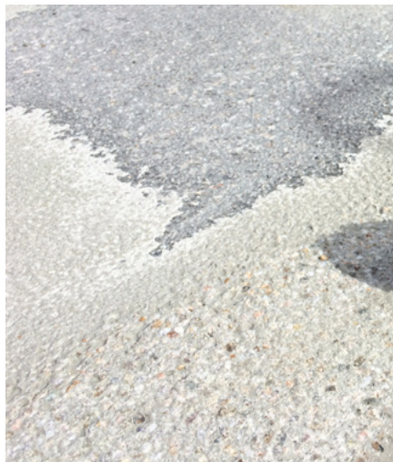
The remnants of a 10 mm overlay after three passes with the HTC Ravager™