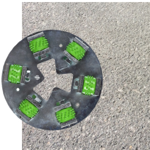
Profile of concrete after one pass with the HTC Ravager™

HTC Ravager™ tools can also achieve a standard surface preparation profile equivalent to International Concrete Repair Institute's (I.C.R.I.) Concrete Surface Profile (C.S.P.) standard of 6-7 using your HTC grinder.